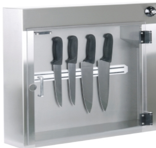
Model GSN 2000 (polycarbonate door)

Usually, during UV sterilization waves of 210-328 mm length are used (the most active is radiation of 254 mm). It is recommended to sterilize at least for 90 minutes. Only after such a period of time all the bacteria will be destroyed.