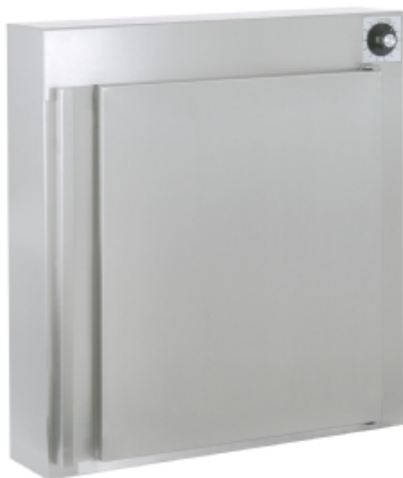
Model GSN 1000 (stainless steel door)

We would like to remind you very useful device, which becomes more and more popular in Poland. It's about the steriliser for knives type GSN with UV radiators, which is used for knives' sterilization by irradiation of UV radiation. This radiation changes the structure of nucleic acids, therefore it has the biggest effect on the vegetative forms of microorganisms. The steriliser for knives with UV radiators is usually installed in kitchens and rooms where meals are being prepared. Their main task is to sterilize the already washed knives with UV rays which destroy vegetative and spore forms of microorganisms. This helps to raise hygienic standards during meals preparation.