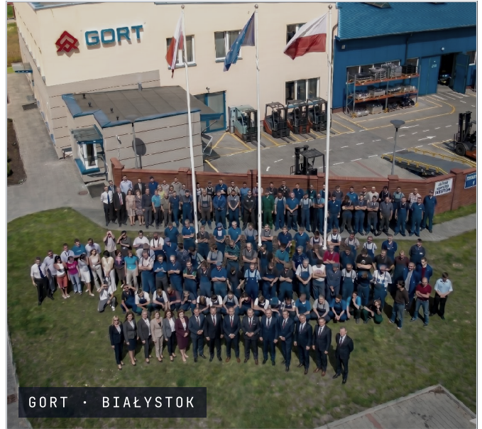
GORT · BIAŁYSTOK

GORT operates a modern industrial manufacturing base in Poland, combining advanced metal fabrication, engineering, assembly and scalable production infrastructure for international projects and strategic partnerships.