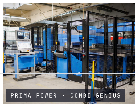
PRIMA POWER · COMBI GENIUS