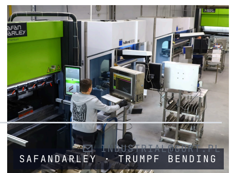
SAFANDARLEY · TRUMPF BENDING